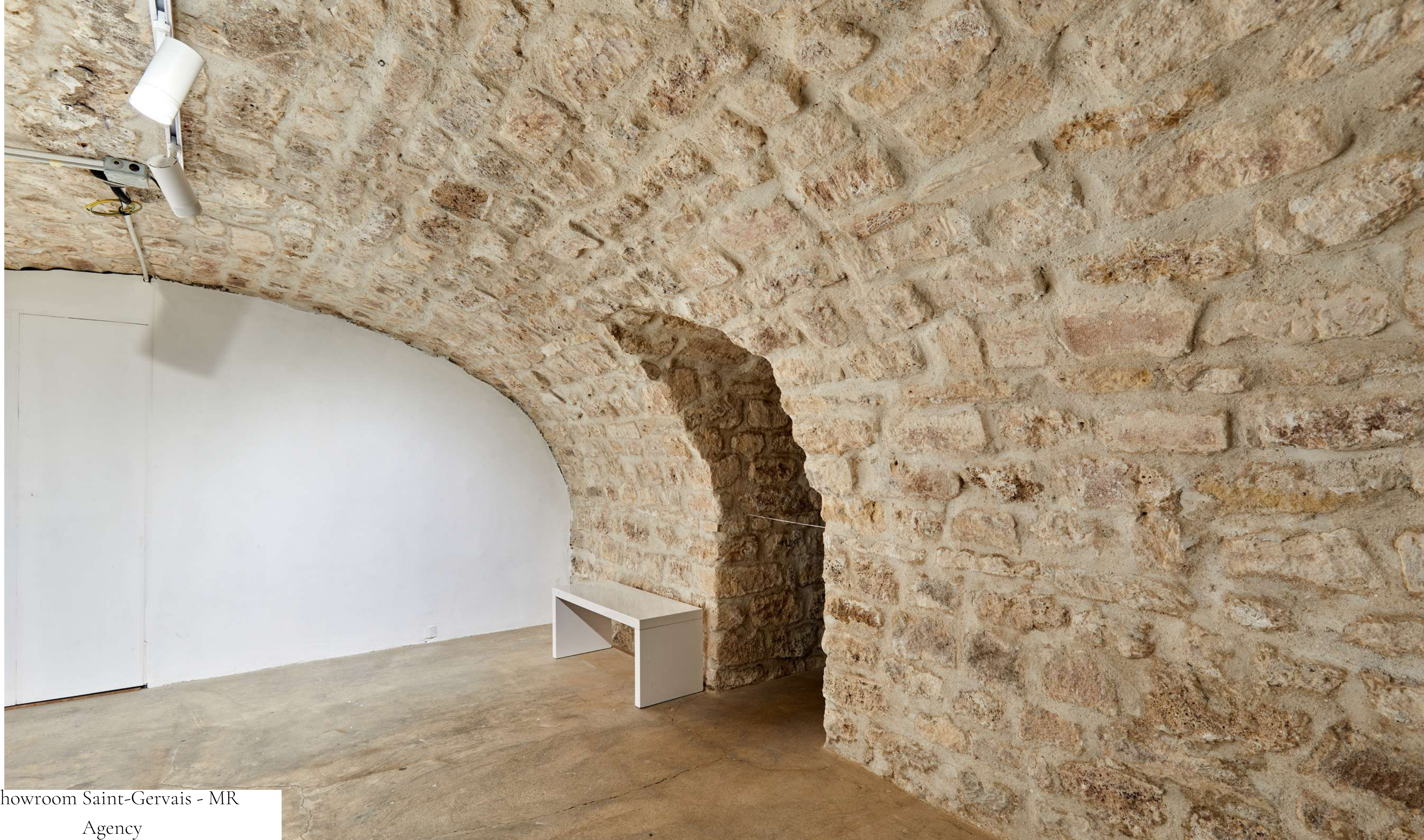
Showroom Saint-Gervais - MR