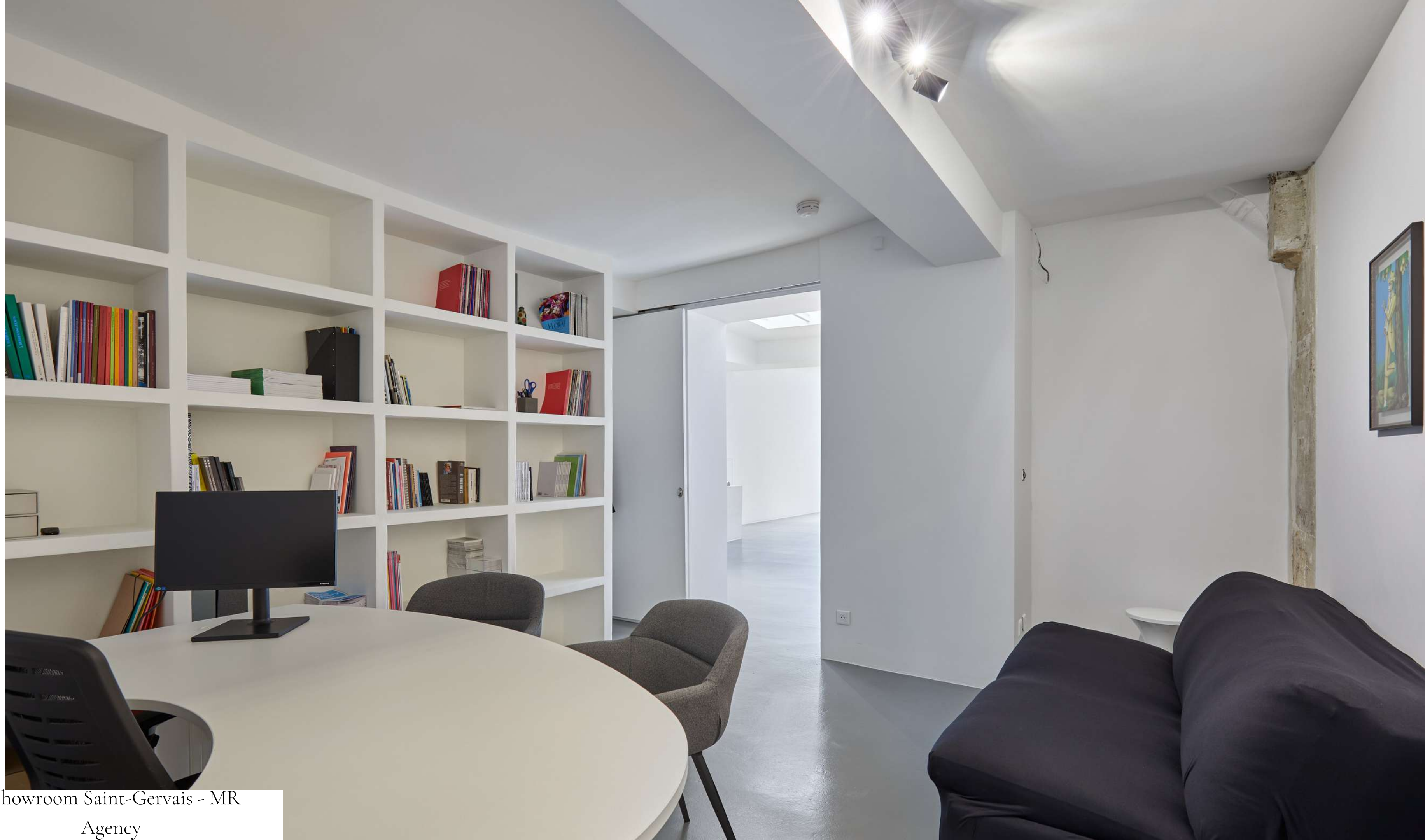
Showroom Saint-Gervais - MR Agency