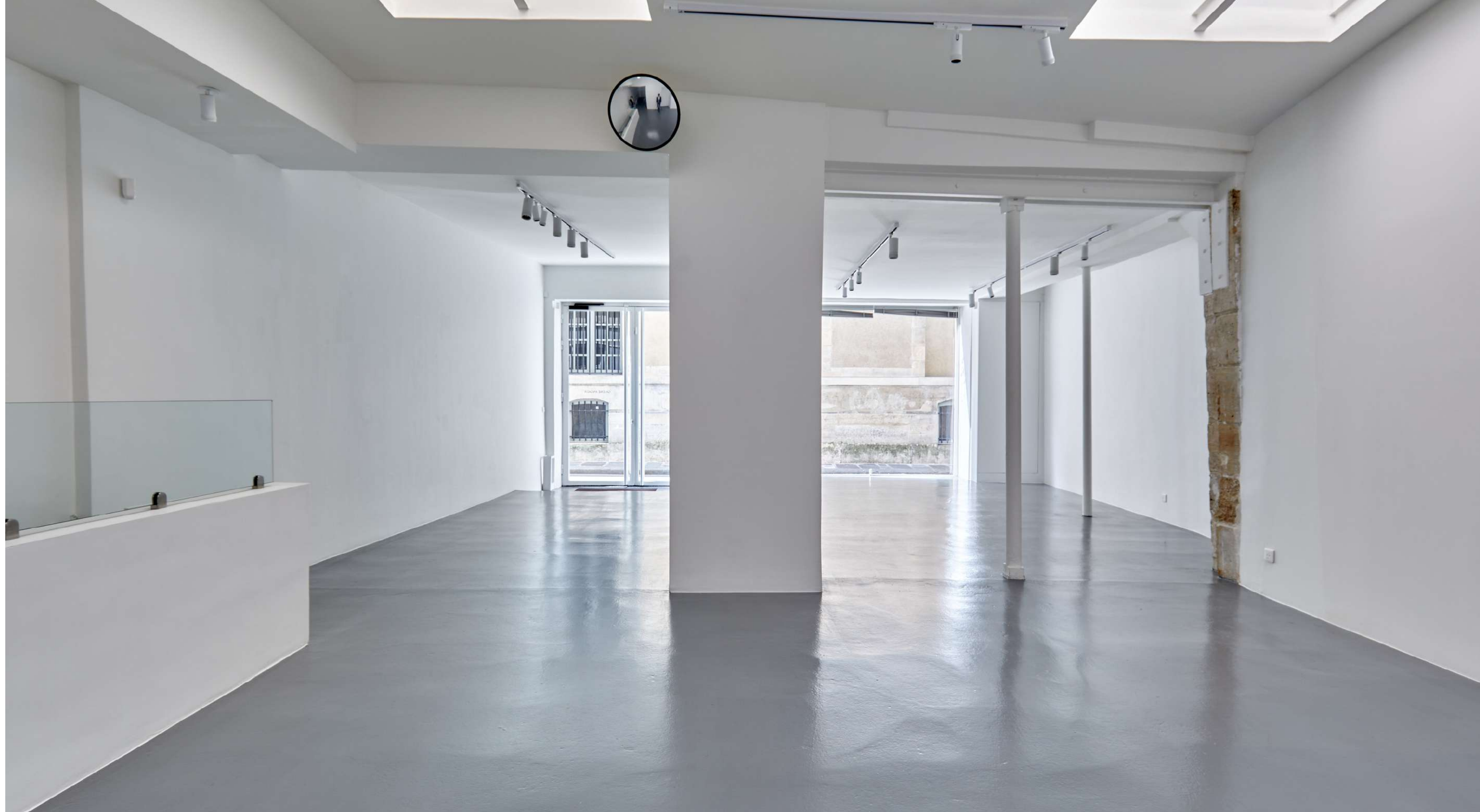
Showroom Saint-Gervais - MR Agency