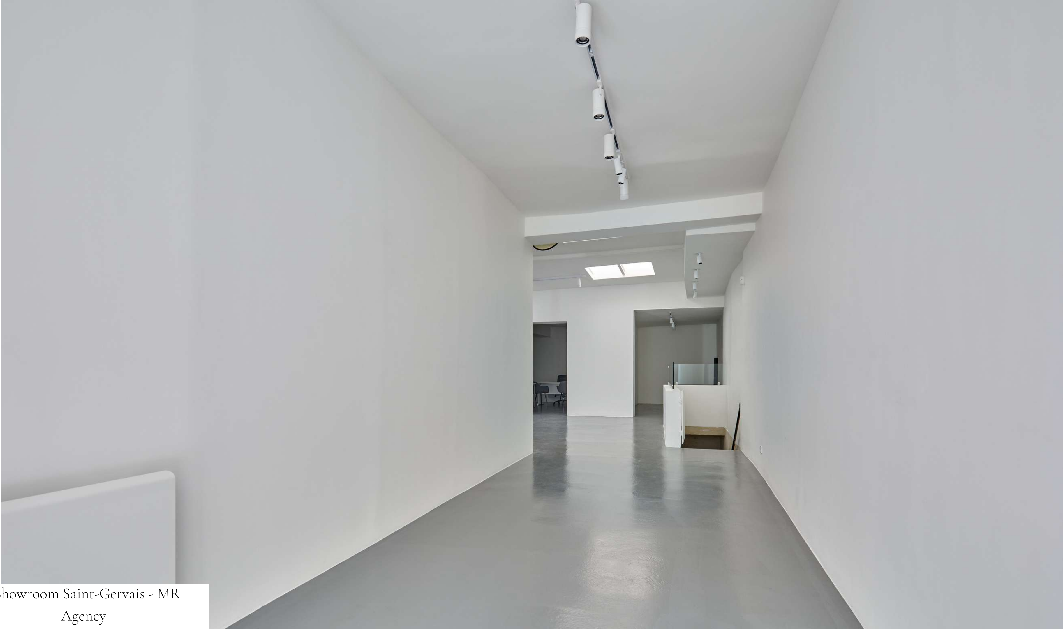
Showroom Saint-Gervais - MR Agency